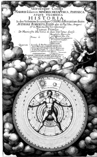
(a) Cover Page of Fludd's Utriusque